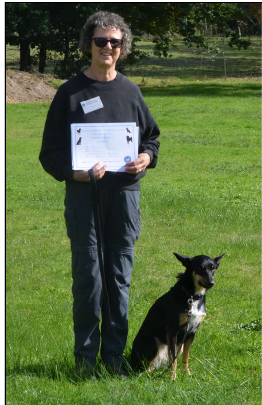
Di and Poppy , QC in Rally Novice.