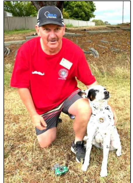
Frog & Chance 3 rd