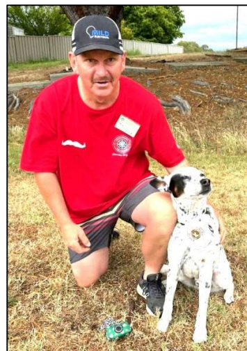
Frog & Chance 3rd